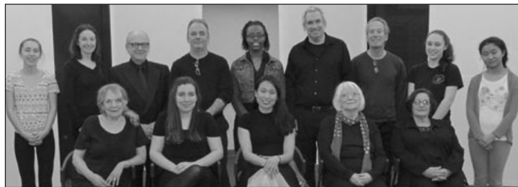
2016 cast from our twenty-year celebratory program.

You are invited to stay for a reception after the show.