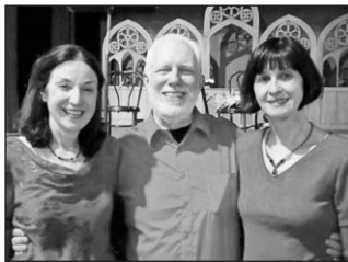
The Hot to Trot Trio

They have performed in the Thomaston Opera House, the Easton Library, and several senior-living centers. The trio was recently featured on local radio station WPKN for a Sunday Afternoon Brunch Concert .